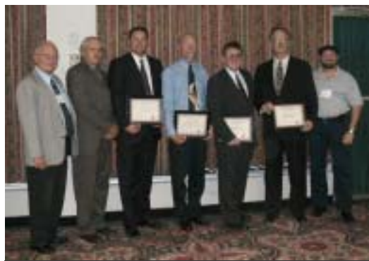
ARDLA excellence awards

Distance Learning continues to be a vital source of information and education throughout the world. Be apart of an organization committed to improving the quality of distance learning throughout Arkansas.